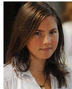
Amanda Knox during her trial in 2009

Court supported he had been wrongly imprisoned. However, the court ruled that Sollecito wasn't entitled to compensation because his conduct contributed to his conviction. The court stated that Sollecito made “contradictory or even frankly untrue” statements when Kercher's murder was being investigated, which constituted “intent or gross negligence” on his part.