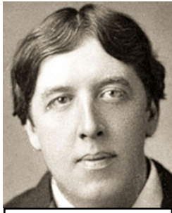
Oscar Wilde

The two crimes were decriminalized for private homosexual activity between consent-