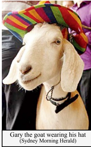
Gary the goat wearing his hat