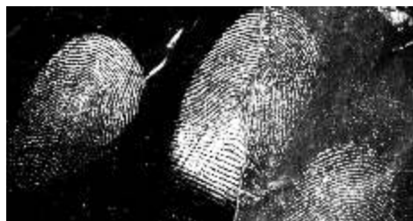
Latent fingermarks identified on aluminium foil using the immunogenic method developed by Dr. Xanthe Spindler (Dr. Xanthe Spindler)

Dr. Spindler also stated: "We've been able to successfully target amino acids on non-porous surfaces for the first time, with promising results in enhancing aged and degraded fingermarks that typically give poor results with traditional powdering and cyanoacrylate fuming. The potential is there to go back to old cases to see what might now be recovered."