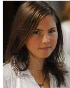
Amanda Knox during her trial.

The prosecution's case largely hinged on forensic testimony that suggested Sollecito's DNA was recovered from Kercher's bra strap, and Knox's DNA was found on the handle of a knife recovered from Sollecito's apartment that had Kercher's DNA on the blade, although no blood was found on the knife. None of Knox or Sollecito's DNA was found in Kercher's bedroom, none of the shoeprints imprinted in blood in her bedroom were made by either of them, and none of Kercher's blood was found on any of Knox or Sollecito's clothing or shoes, or in his apartment. The judge denied the request of Knox and Sollecito's lawyers for an independent review of the DNA evidence.