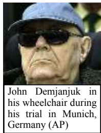
John Demjanjuk in his wheelchair during his trial in Munich, Germany

Demjanjuk’s defense was he was the victim of mistaken identity: He fought in the Soviet Army and was captured by the Germans in