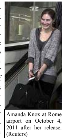
Amanda Knox at Rome airport on October 4, 2011 after her release.