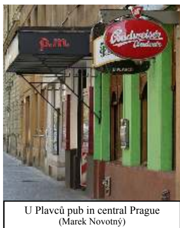
U Plavců pub in central Prague (Marek Novotný)

Czech court quashes communist conviction of Plastic People member, Czechposition.com, June 22, 2011 Top court cancels 1973 verdict that sent four writers to jail for anti-Soviet song, Radio Praha, June 22, 2011