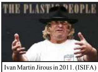
Ivan Martin Jirous in 2011.